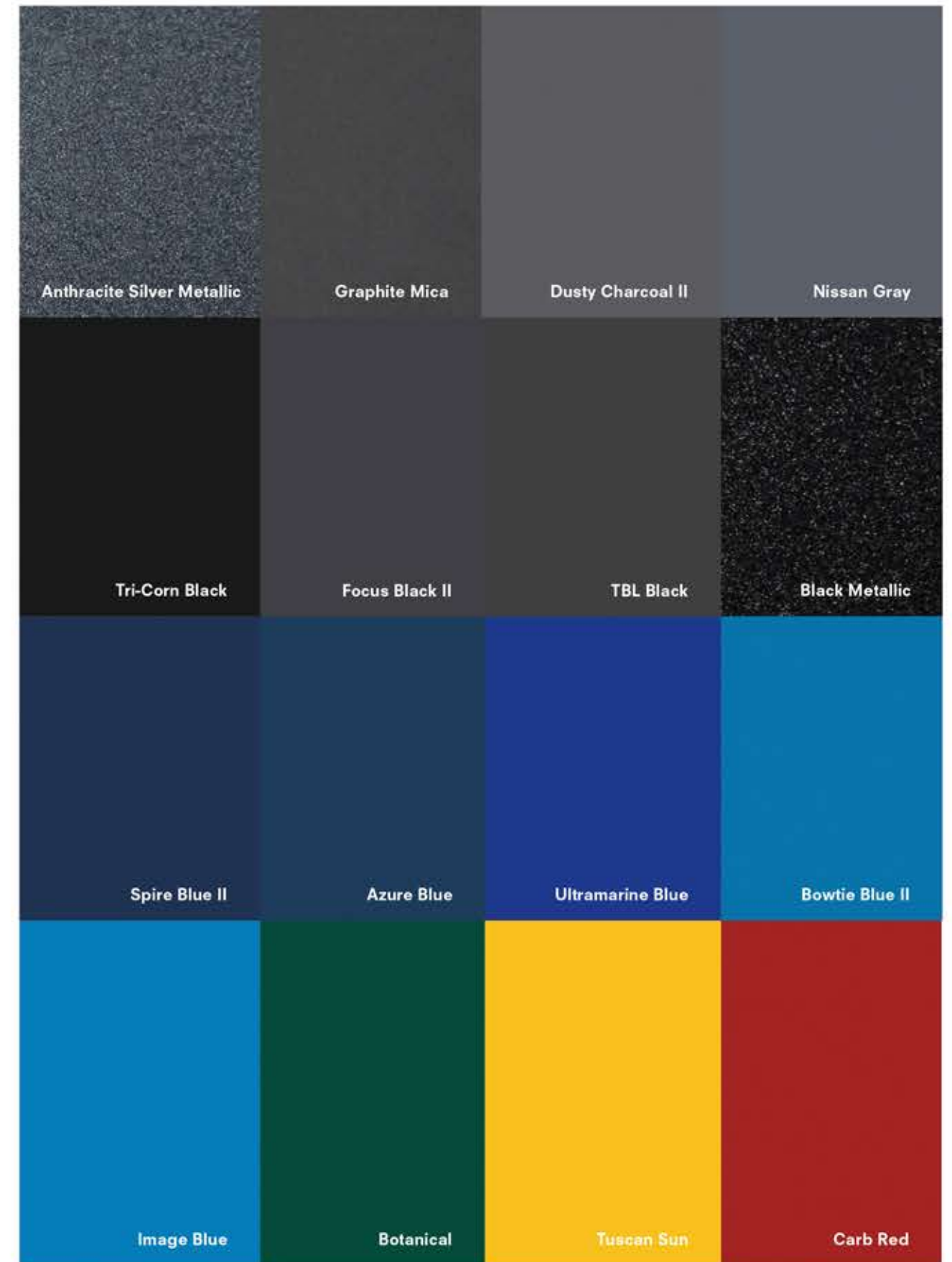
The Classic Collection