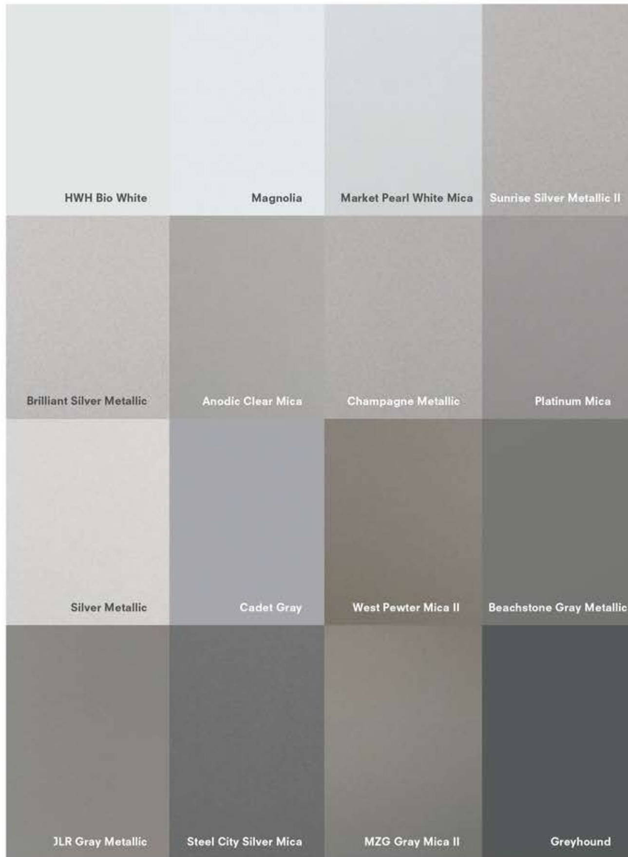
Alumatek - Outdoor Finishes